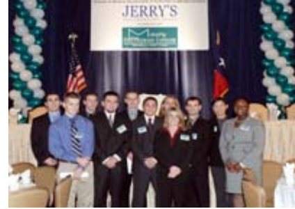
Pictured are 2005 Wright Interns at the Jerry Durant Family of Dealerships Leadership Luncheon.